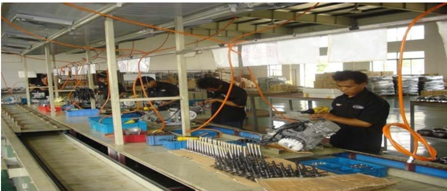
Vmoto Scartt assembly line and tooling in-transit from Spain: