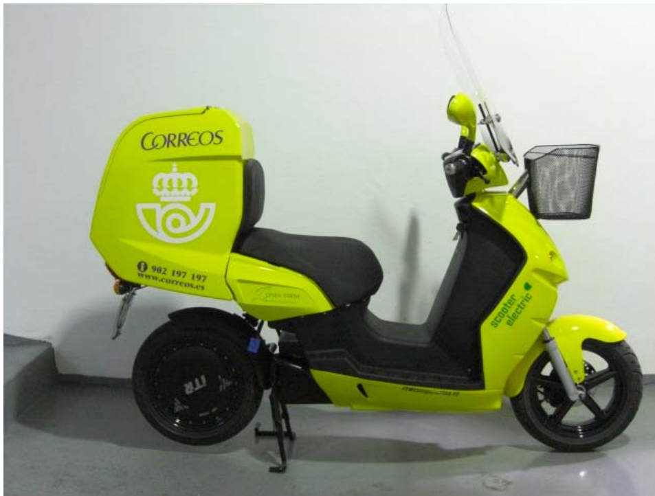
Vmoto Emax 110 SD 65 delivery scooter specifically designed for delivering Spanish mail.

The Vmoto Emax strategic alliance is a 60/40 partnership with manufacturing taking place at Vmoto's Nanjing manufacturing facility. In addition to the Correos order, Vmoto Emax has confirmed orders for approximately 1,000 electric scooter units for delivery over the next few months.